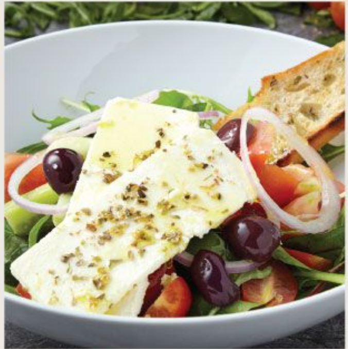
Greek Salad 🌿

Sun-dried and cherry tomatoes, olives, grilled potatoes and shallots, mesclun salad with Italian dressing and crispy bread.