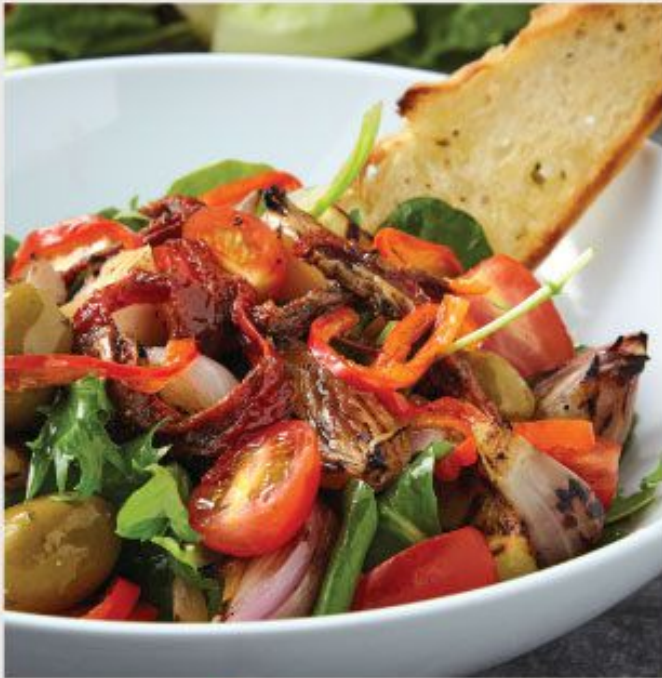
Garden Salad 🌿