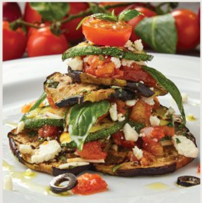
Layered Eggplant 🌿

Seared tuna, mesclun salad, feta cheese and lemon dressing served with a spicy mayo sauce.