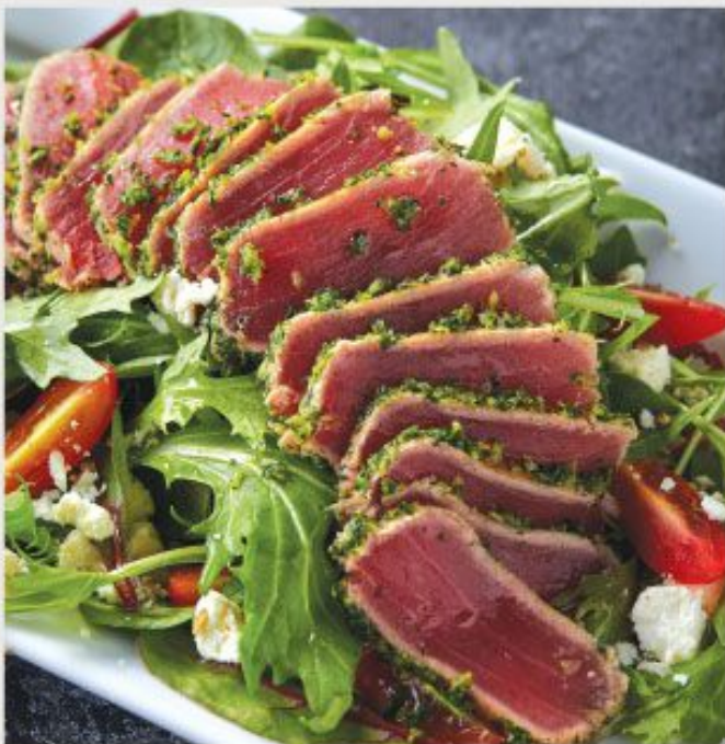
Tuna Tataki Salad

Mesclun salad, sliced feta cheese, tomatoes, cucumber, shallots and Kalamata olives with lemon dressing and crispy bread.